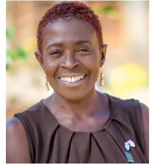
Denise Double-lung Recipient